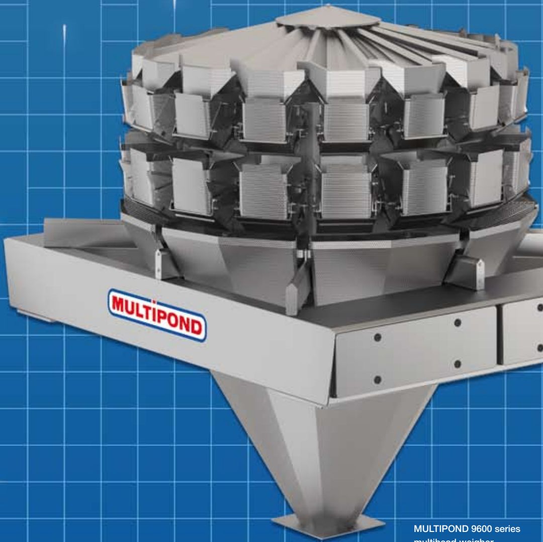
MULTIPOND 9600 series multihead weigher